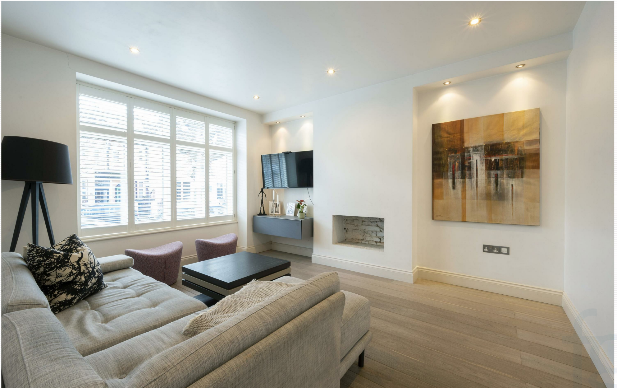
Southdown Road, Wimbledon, SW20 8PT